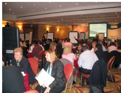
DOH Dignity in Care event in Leeds

In March 2007, the Department of Health hosted a Dignity Event at Leeds, which attracted a wide range of health and social care agencies in the voluntary, statutory and independent sectors. The event was designed to enable people to learn from each other's experience and acquire new energy and ideas to make a difference.